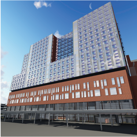
James Cancer Hospital