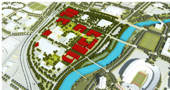
Long-term Mid-West Campus Development — Proposed interdisciplinary research hub for the university on Mid-West Campus.