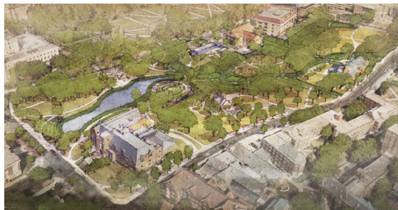
Historic Mirror Lake District — Conceptual rendering for the restoration of historic Mirror Lake and the surrounding district focusing on safety and sustainability.