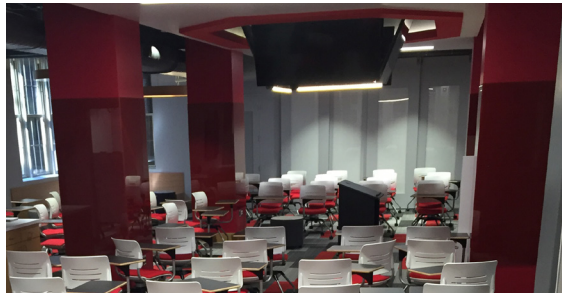
Campbell Hall Faculty Innovation Center — The newly constructed Faculty Innovation Center in Campbell Hall is used to teach faculty how to utilize the resources in an active learning classroom.